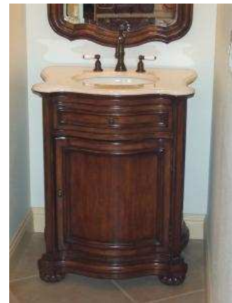
Cole Verona Vanity in Aged Chestnut w/ Creme Marble Top, Linen Undermount Basin, and Matching Mirror ($1380)