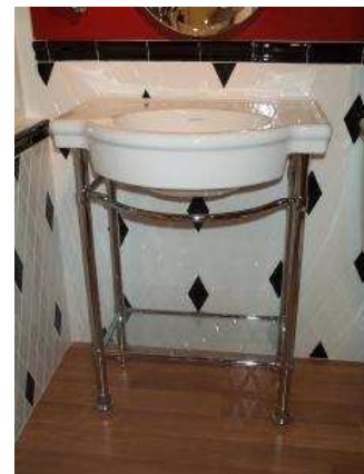
American Standard Retrospect Console (above) and Retrospect Washstand (below) $330 each.