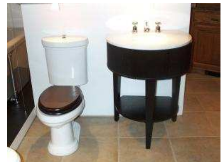
Porcher Archive Vanity ($1855) and Toilet ($450)

These plumbing and appliance displays are marked down for clearance to make room for new products. Give us a call to learn more.