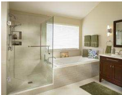
This traditional remodel is darker toned and more formal.