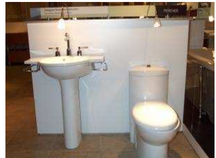
Porcher Sapho Pedestal ($397.50) and L'Expression Toilet ($399.50)