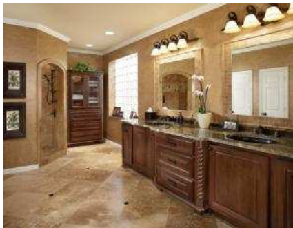
Regardless of style, these projects were executed flawlessly, and resulted in beautiful, functional bathrooms with happy homeowners.