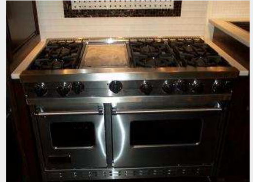
Viking 48" Range